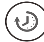
12 Hrs/Day 150 LM/W