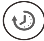
12 Hrs/Day 150 LM/W